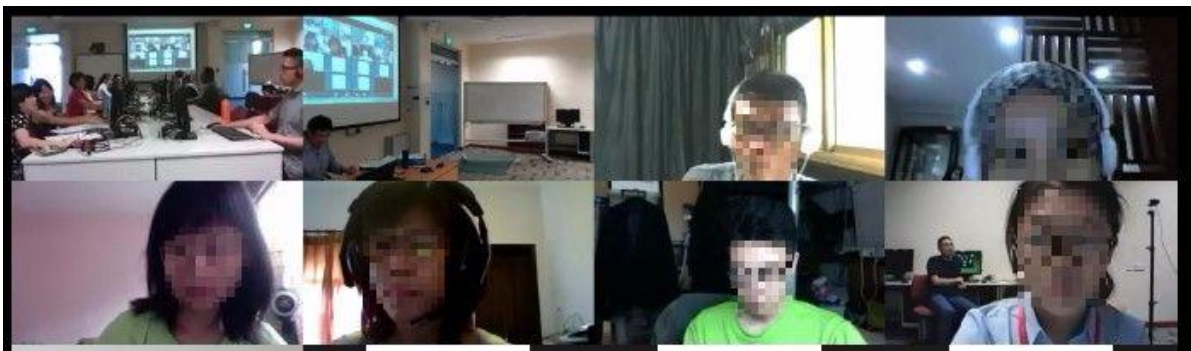
Figure 4. An illustration of the BSLE.

Implementation. Eight online students attended this session online. The instructor and most online students joined the video conferencing room before the lesson started. The instructor further reminded the online students to mute their mics. The student who complained about the sound problem attended this session from home again. He was happy with the improved quality of sound. Figure 4 shows what the BSLE looked like in this session.