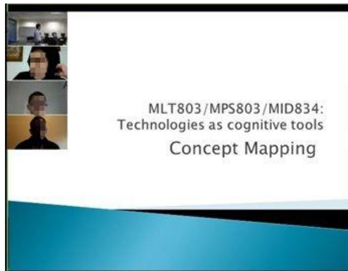
Figure 3. A screen capture of the instructor's computer.

Implementation. Three students attended this session at homes while the rest were in the classroom. Every online student successfully connected to the video conferencing room before the start of the lesson. As shown in Figure 3, their streaming videos were clearly displayed on the classroom projector. The instructor shared the PowerPoint slide with the online students using the tool Zoom. Both the online and classroom students could view the slide and the streaming videos. The instructional process was video recorded in Zoom and later uploaded to the course web site for the students to review.