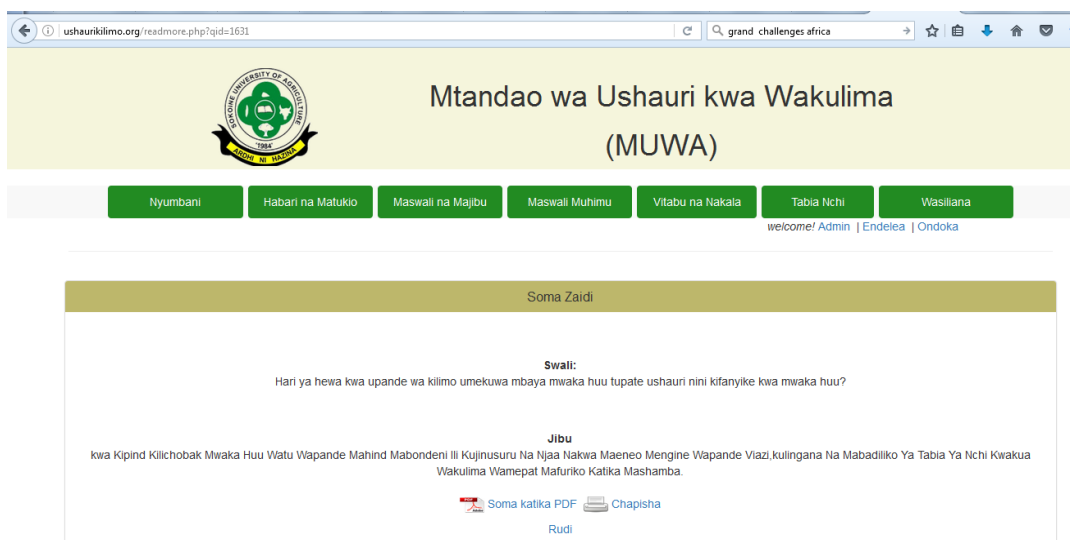
Figure 7. Advice from extension agent about what to farm after flooding has occurred in Kilosa.

Furthermore, farmers sought information about floods after it has occurred in 2016. The extension agent advised the farmer to farm crops that can yield in short periods of time (Figure 7).