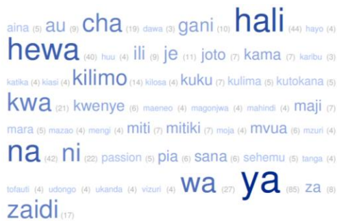
Figure 5. Word cloud after analysis using TagCrowd.

With the Wordle analysis, it is not easy to determine the frequency of appearance for each word asked by farmers. Thus, we opted to subject analyse the same texts using a different tool for analysis called “TagCrowd.” The results after the analysis using TagCrowd is as depicted in Figure 5.