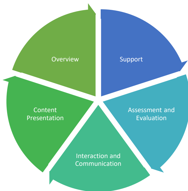
Online Course Design Elements Framework