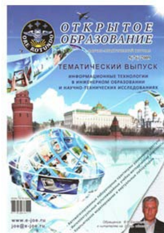
Figure 3. Journal cover of Open Education (2009).

Within the Russian literature the term distance education is similarly discussed but conceptually isolated from the older term correspondence education (cf. Ovsyannikov & Gustyr, 2001). This distinction is for example adopted by the Russian journal Open Education (Открытое образование), which can be regarded as equivalent to the prominent British journal Open Learning , yet the Russian version employs a greater focus on technological aspects of online distance education. Open Education was first released in 2002 and is published by MESI.