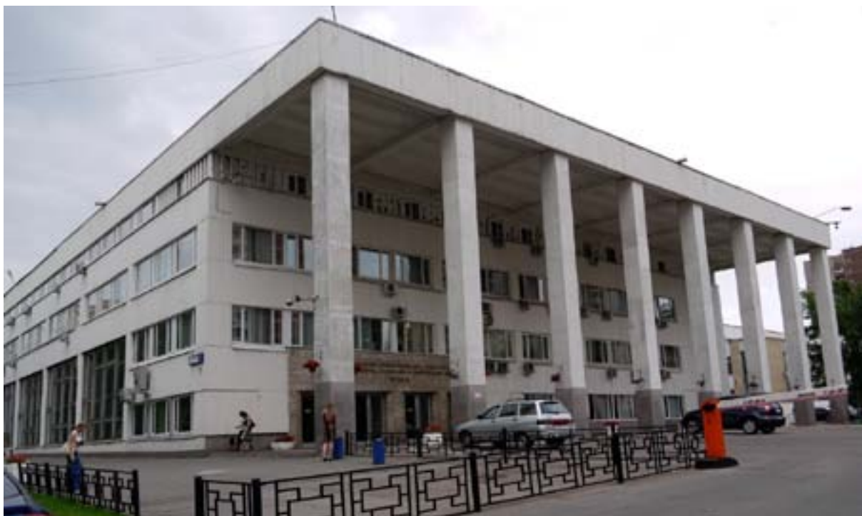
Figure 1. Main entrance of MESI at the campus in Moscow (Source: private photograph, June, 2010).

With the introduction of internet-based learning and teaching in 1992, MESI was one of the first to do so. Today MESI counts a total of 109,700 registered students, of which 9,200 are face-to-face students studying at the campus in Moscow. The average age of the students is 24; 63% of the students are female and 47% are male (October, 2010). Although its headquarters is located in Moscow, MESI operates another 37 regional centres and branches at higher education institutions all over Russia, which can be compared to the system of study centres/regional centres at other distance universities, such as the FernUniversität Hagen in Hagen or the British Open University in Milton Keynes.