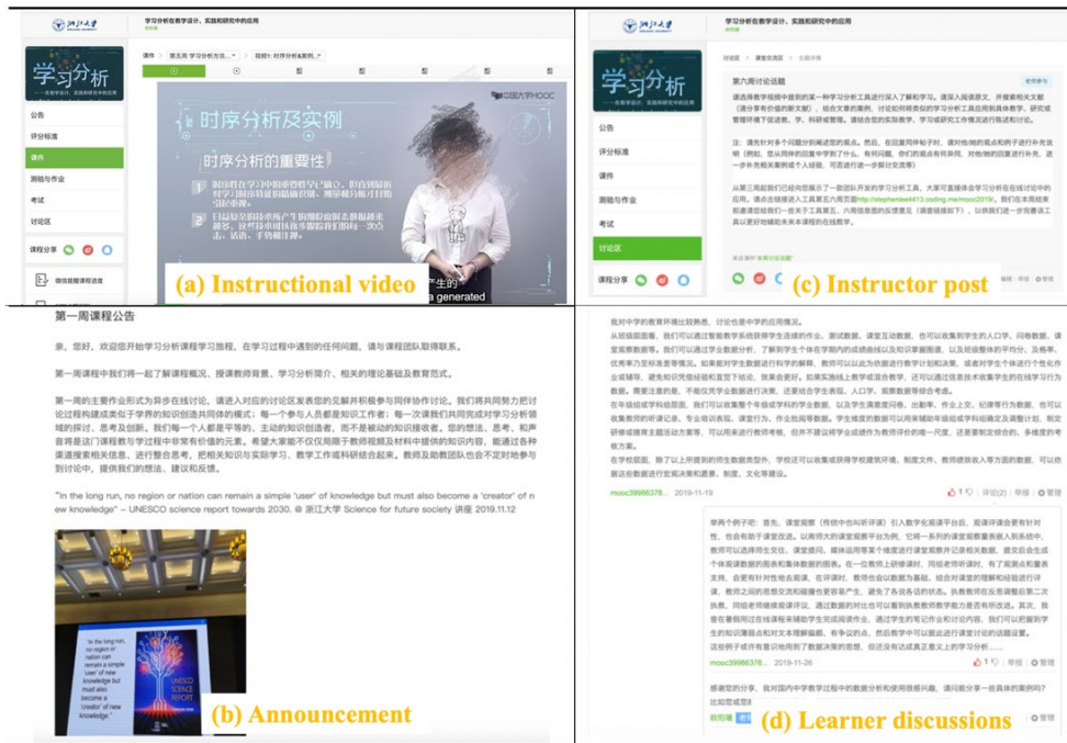
Figure 1. The MOOC platform.

We used a combination of pedagogical strategy, a learning analytics tool, and a social learning environment to foster learner engagement in discussions. First, we used a knowledge-construction pedagogical strategy and related prompts, such as sharing and comparing information, elaborating of opinions, exploring dissonance among ideas, negotiating meanings, and synthesizing knowledge (see Figure 1). Second, from a technological perspective, we designed and devised a student-facing learning analytics tool to demonstrate learners' discussion processes with the interaction, topic, and epistemic networks (see Figure 2). The interaction network demonstrated learners' social interactions with others; the topic network demonstrated learners' use of keywords; and the epistemic network demonstrated five dimensions (i.e., concept, procedure, fact, strategy, and belief) shown by the learners in their posts. This analytics tool was hosted as a Web page and embedded in the course discussion forum. Finally, we built a social learning environment through the use of social media and MOOC forum. We used the group function of a popular Chinese social media tool named WeChat to build a self-organized community through which learners could foster a sense of belonging (see Figure 3). We also designed a social section in the forum for learners to share personal life stories or interesting topics.