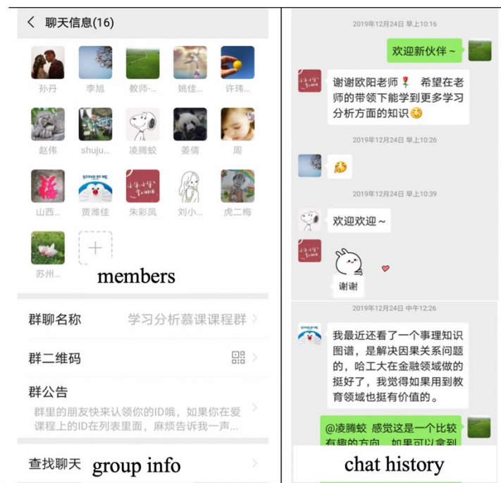
Figure 3. The WeChat group.

From “An Application of a Learning Analytics Tool in MOOC,” Fan Ouyang research team, n.d. ( https://8jrsl.coding-pages.com/ ). In the public domain.